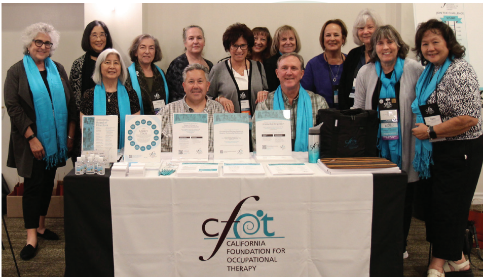
2025 CFOT Board Members Raising Awareness and Donations