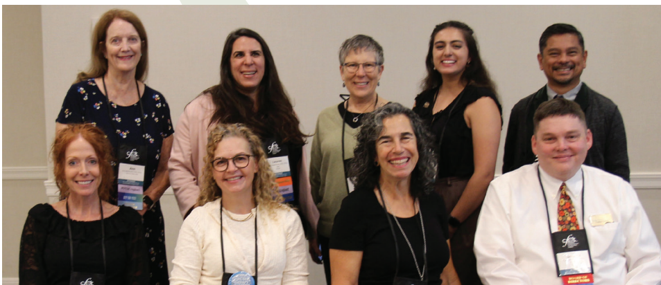
2025 Research Grant Awardees