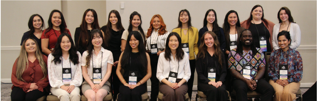
2025 Scholarship and Traineeship Awardees