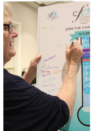
2025 CFOT Fundraising Goal Met