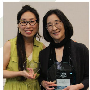
2025 Humanitarian and Honored Lecturer Awardees